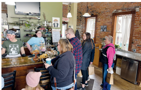
Downtown Owosso Chocolate Walk