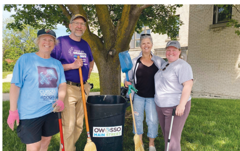
Community Cleanup Event

“As board chair and resident member of our DDA, I see the value of our Main Street program in my professional and personal life. Its programming has improved Owosso visually, economically, and grown our community.”