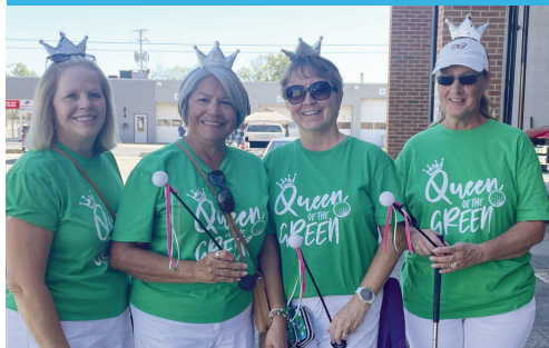
Mini Golf Madness